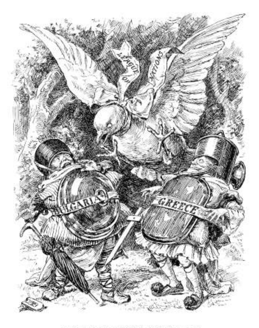
"JUST THEN CAME DOWN A MONSTROUS DOVE WHOSE FORCE WAS PUBLLY MORAL, WHICH TURNED THE HEROES' HEARTS TO LOVE AND MADE THEM DROP THEIR QUARREL."

A British cartoon published in November 1925.