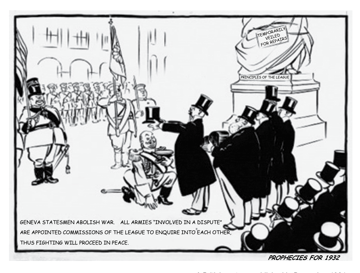
A British cartoon published in December 1931.